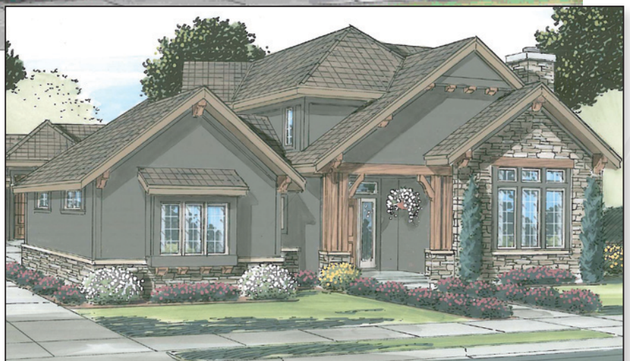
Optional 2 Story Rendering

1942 square foot ranch with 2 bedrooms, 2 baths. Optional 632 additional square footage with upstairs loft and 3rd bedroom with full bath. Expansive living area with vaulted ceilings and gas fireplace. Large gourmet kitchen with island and walk-in pantry. Luxury master suite with large walk-in closet. 2 car and large RV garage.